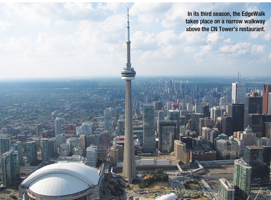
In its third season, the EdgeWalk takes place on a narrow walkway above the CN Tower's restaurant.